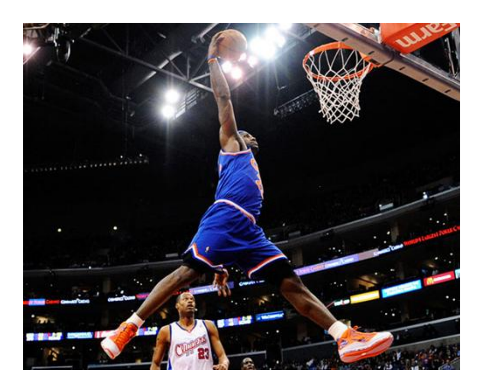
Figure 10. LeBron James slam dunk.