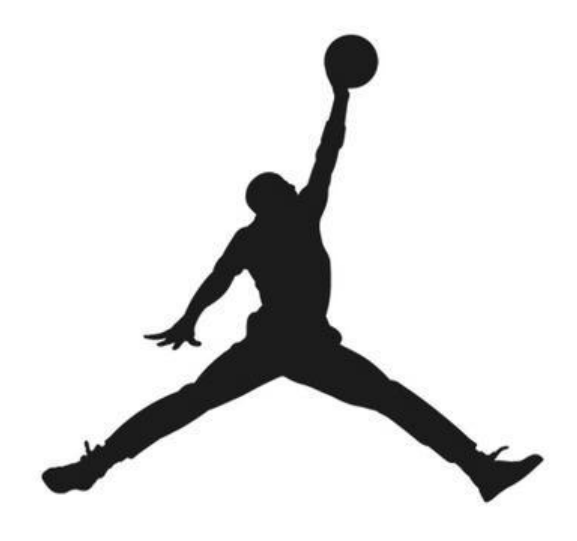
Figure 9. Nike "Jumpman" logo (used to promote Michael Jordan merchandise).