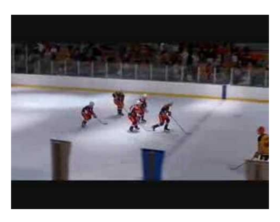
Figure 1. The Might Ducks' "Flying-V" hockey formation.