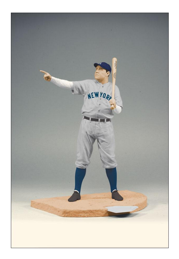
Figure 6. Babe Ruth "calling his shot."