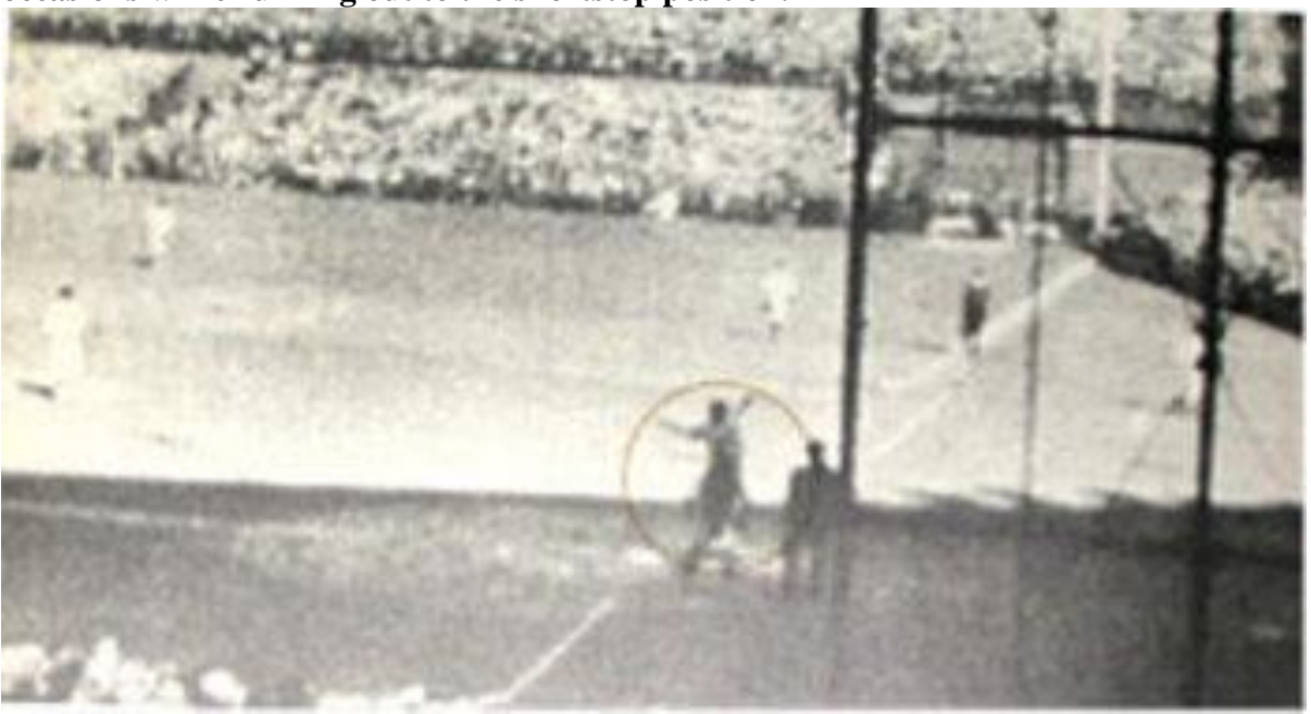
<u>Figure 5</u>. Babe Ruth "calling his shot" (home run hit on October 1, 1932 in the MLB World Series).